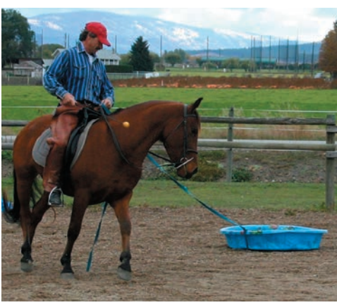
Endotapping at a walk and also bomb-proofing dragging pool