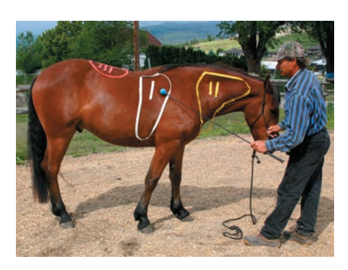
Endotapping zones (review)

I would only suggest cantering when you can keep your horse's poll under control at the walk and trot. The adrenalin