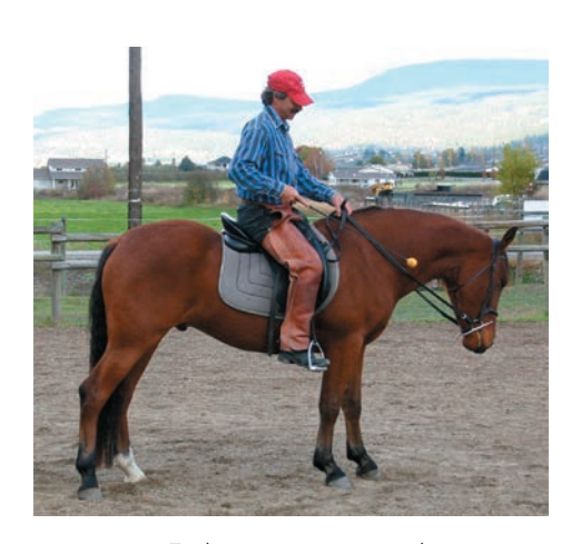
Endotapping at a stand

surge will kick in and cause an excite/ fright cycle unless you have a good cue to relax. If you make sure this is solid inhand you should find very little difficulty with this riding. When I tap at the canter, I tap on zone 2 in the rhythm of the canter I would like the horse to stay in. If my seat and tapping are together in this, the horse usually relaxes into the effortless canter I